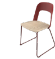
酒红 BURGUNDY (X2)