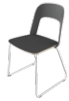
软碳黑 CARBON (X4)