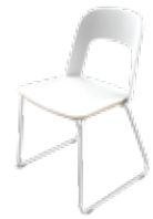
冷灰白 ICE WHITE (X5)