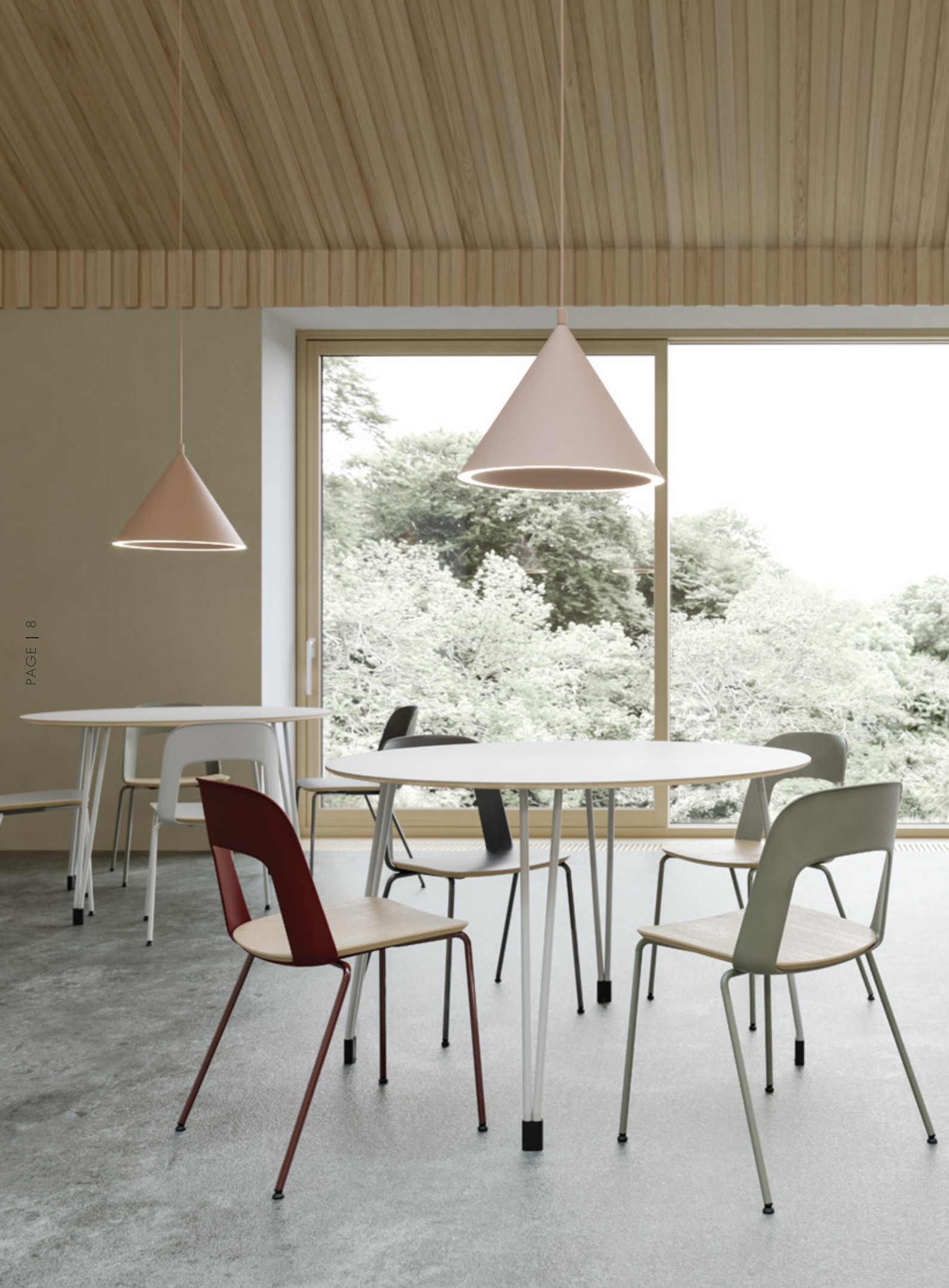
FATA四脚椅酒红椅背配木纹椅座款 / FATA四脚椅橄榄绿椅背配木纹椅座款 / FATA四脚椅碳黑椅背配黑色椅座款 / FATA四脚椅冷灰白款

Designer Vincenzo Vini, has strived to rethink the term “classic” when creating FATA, by mixing materials and matching colors. The backrest comes in plastic. Available in 4 different colors including black, white, green and red. Seat comes in natural oak veneer or in black or white colors. Single FATA chair is a stackable side chair which stacks 3 high. Ideal for elegant contract spaces, bars or home. Canteen Fata chair is a four-seater integrated unit, ideal for restaurants, school canteen.