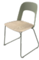
橄榄绿 OLIVE (X3)