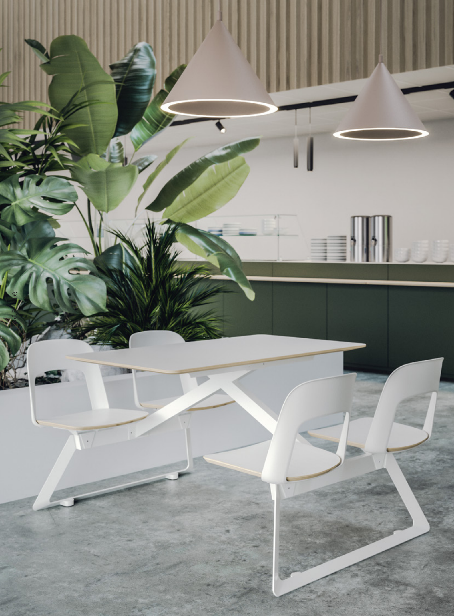
F A T A 连体餐桌椅冷灰白款 / F A T A 连体餐桌椅暖黑款