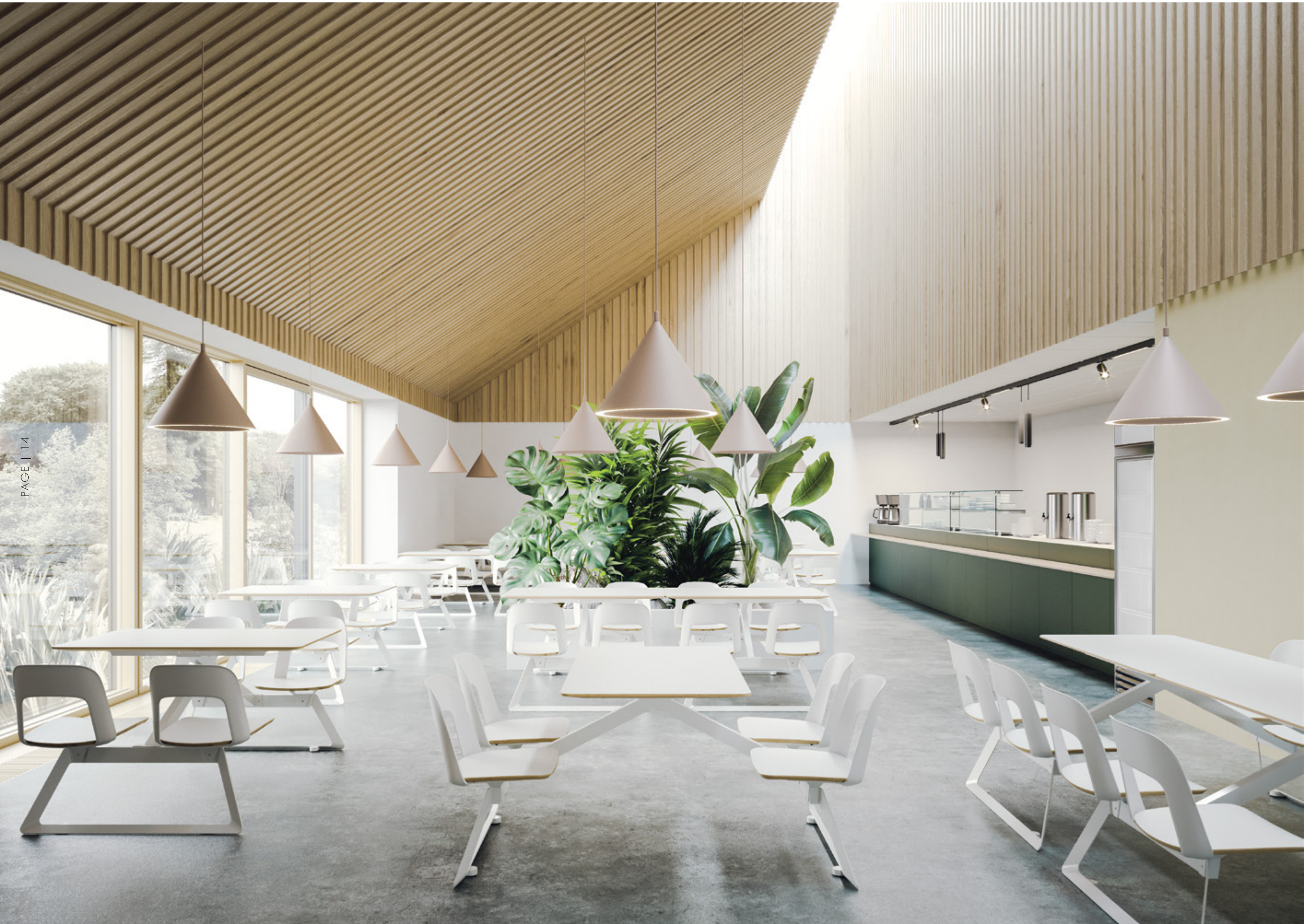
F A T A 连体餐椅冷灰白款